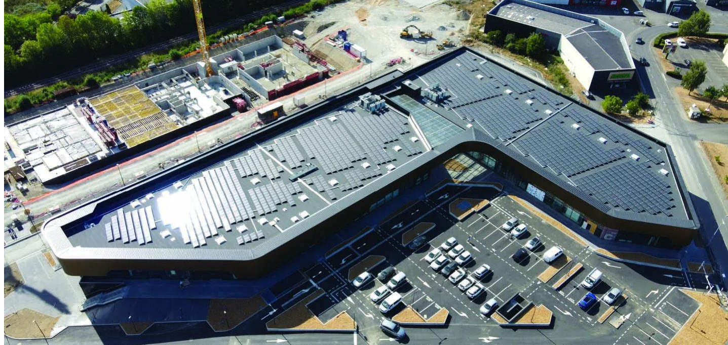
Kerloges shopping center - Chantepie